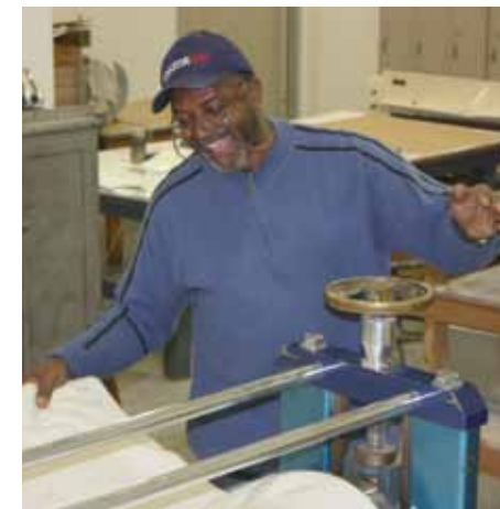
Kerry James Marshall in the Paulson Bott studio.

KJM: It's like a cloud. That's a part of the vignette shape that creates a kind of abstraction or irregularity.