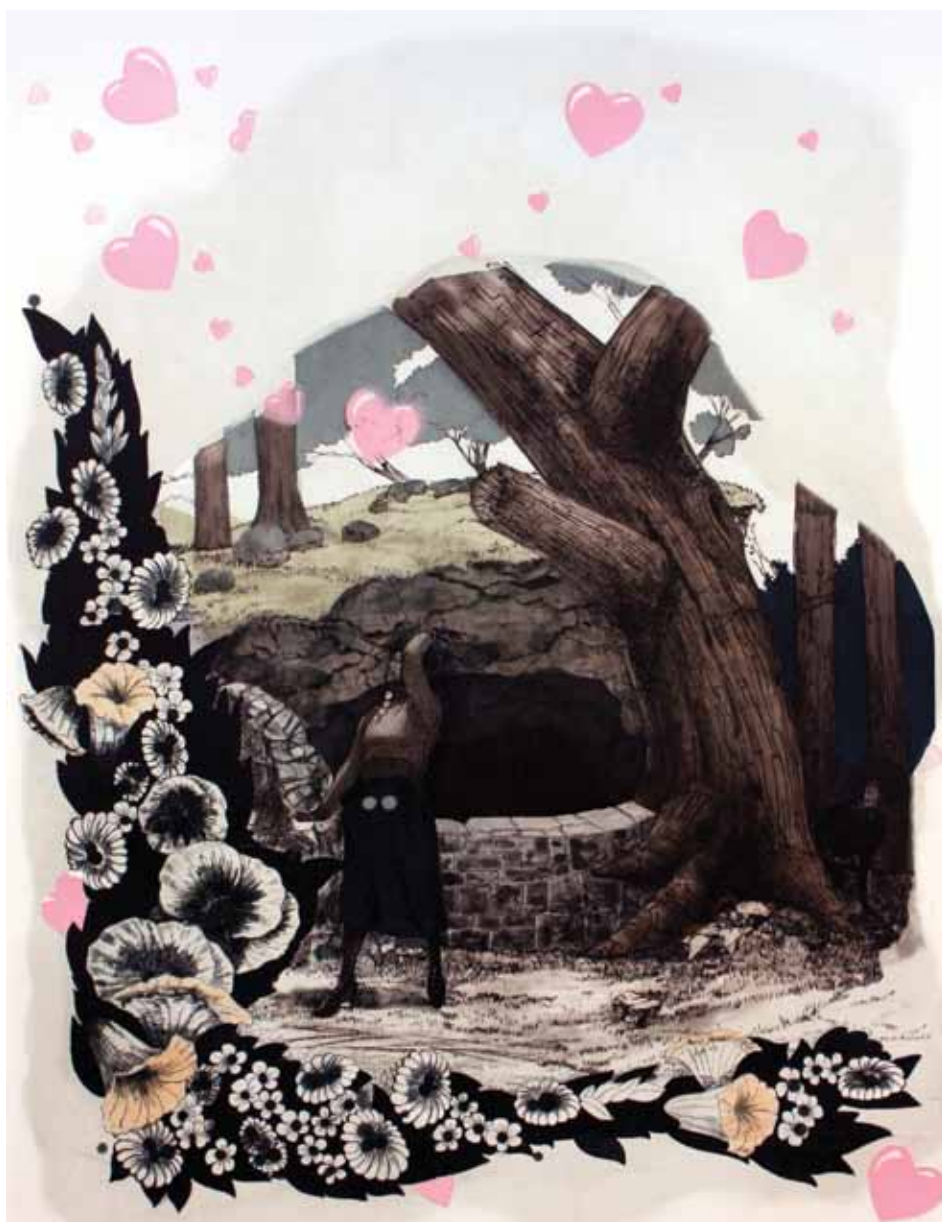
VIGNETTE (WISHING WELL), 2010

I bought a small copper plate, some hard ground, a needle, and some nitric acid. I followed all the instructions—up to the acid bath, which I didn't do because I was afraid of it.